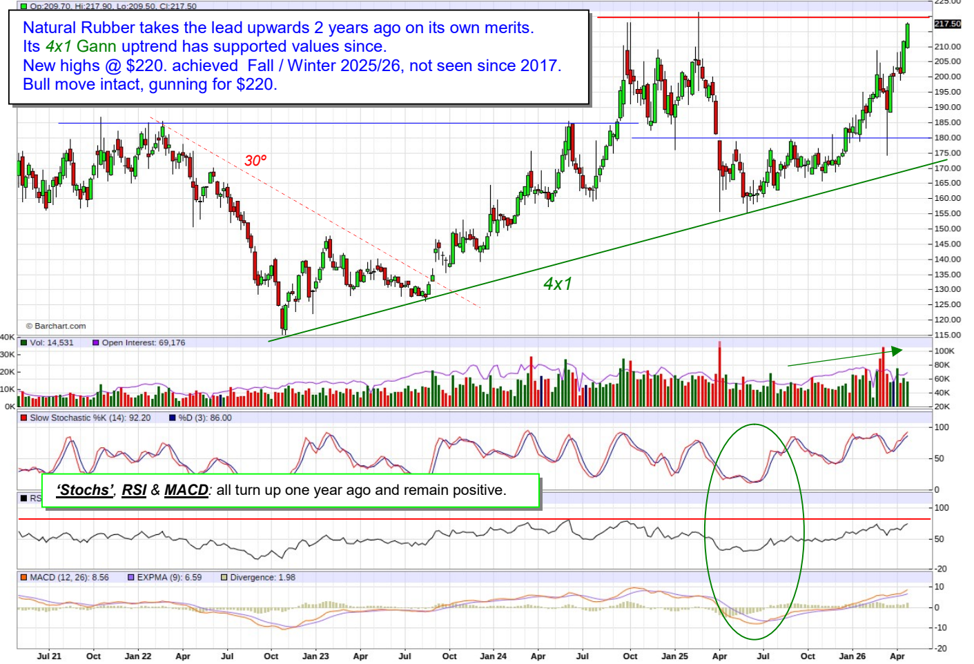
W2 - SGX TSR20 (FOB) - Weekly Nearest Candlestick Chart