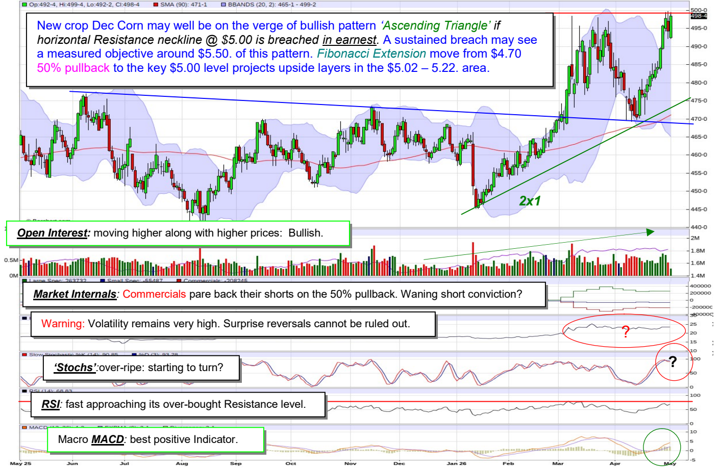
ZCZ26 - Corn - Daily Candlestick Chart

Corn: Daily (Dec): Bullish set-up forming...beyond existing 2x1 uptrend.